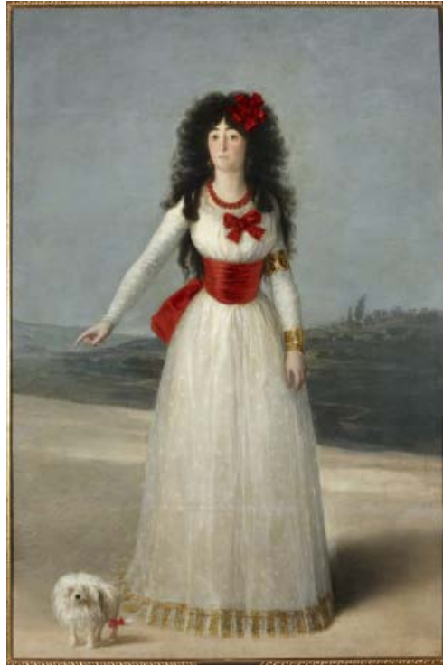
Francisco de Goya y Lucientes (Spanish, 1746–1828). The Duchess of Alba in White , 1795. Oil on canvas, 75 5/8 x 51 3/16 in. Dukes of Alba Collection, Liria Palace, Madrid

depict all the personality of the sitter in such a beautiful way. It is just a great Goya. It is still in the family that commissioned the painting in 1795.