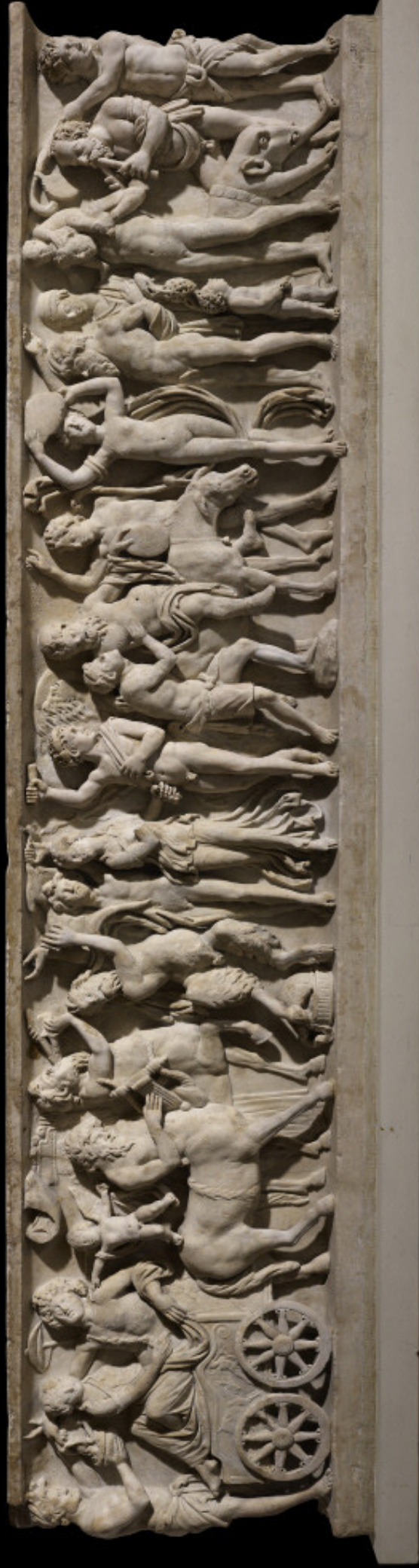
Sarcophagus showing the wedding of Bacchus and Ariadne, 2nd century CE Rome, Italy Marble The British Museum, 1805.0703.130