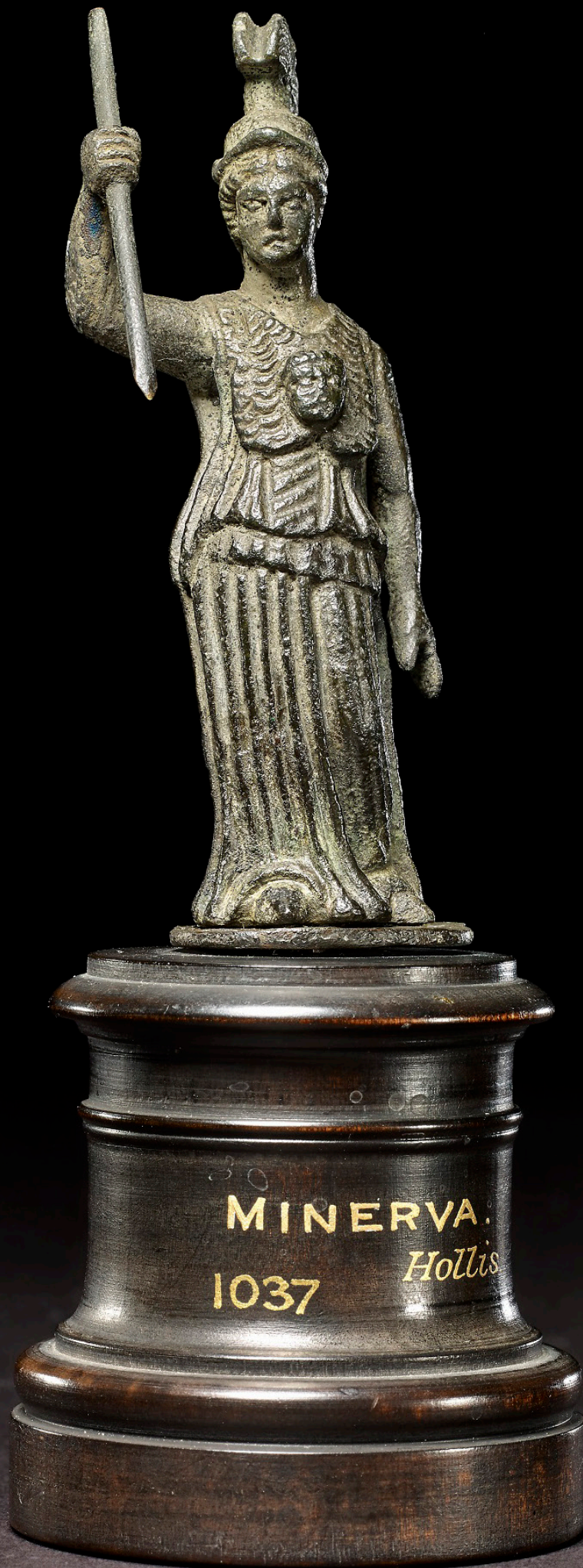
Statuette of Minerva, about 1st–3rd century CE Italy Bronze The British Museum, 1757,0315.11A