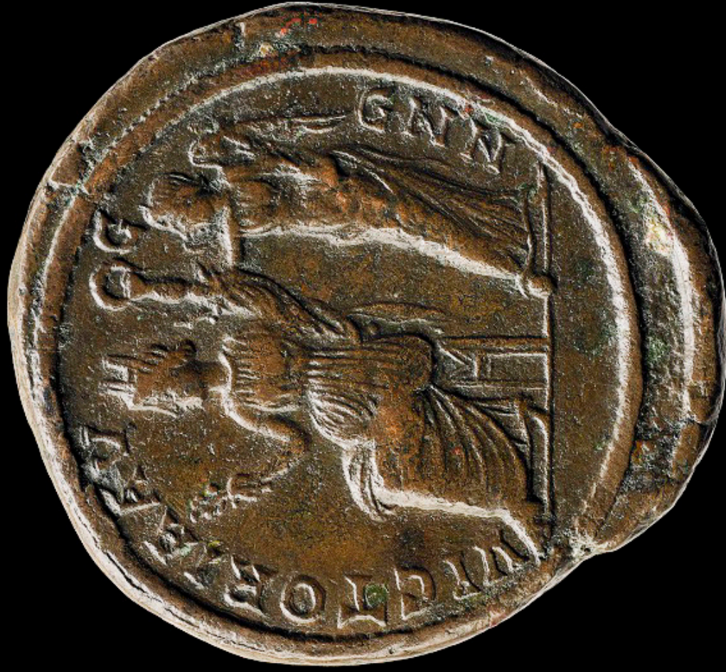
Medallion honoring the city of Constantinople, about 330-47 CE Minted in Rome, Italy Copper alloy The British Museum, R.13024