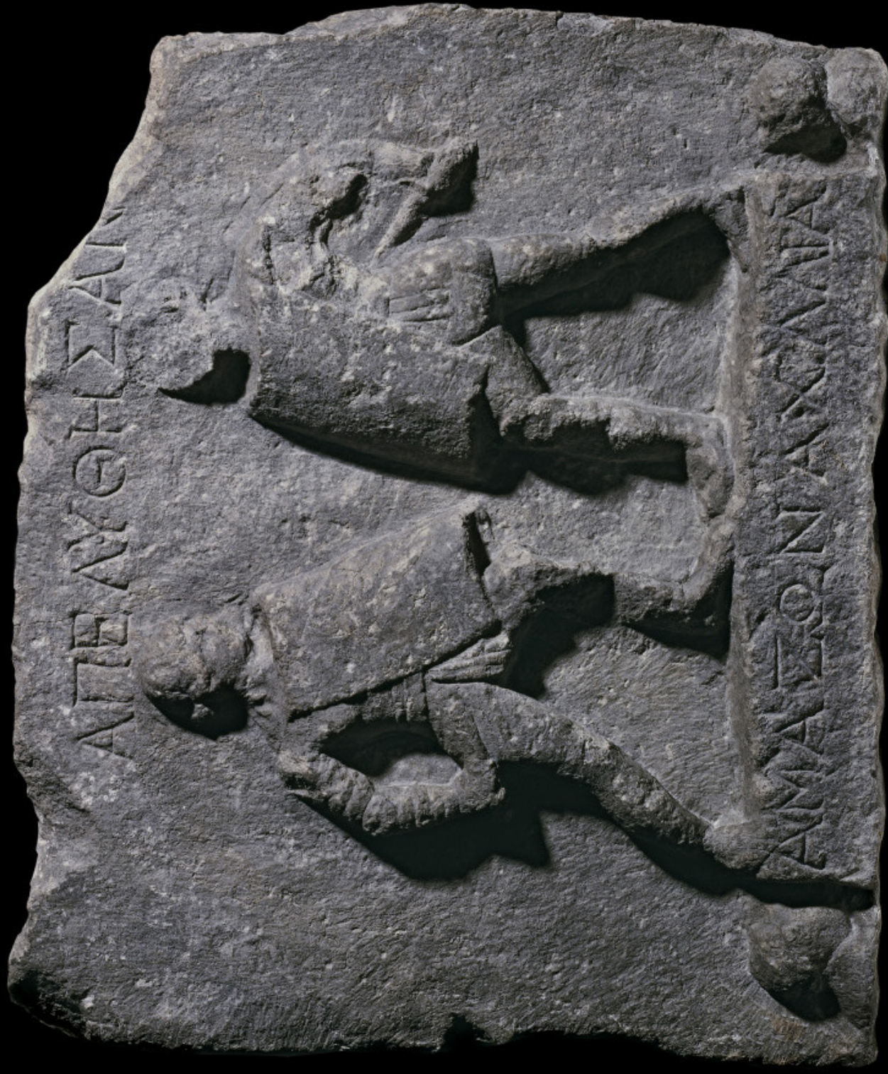
Relief showing two female gladiators, 1st-2nd century CE Halicarnassus (modern Bodrum), Turkey Marble The British Museum, 1847,0424.19