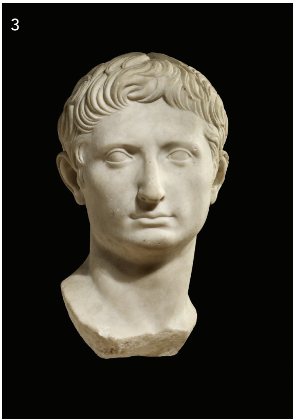
Statue head of Augustus, ca. 30 BCE Rome, Italy Marble The British Museum, 1888,1210.1

The Roman Republican Senate was composed of aristocrats, as well as magistrates elected by citizens. During the late Republic, many people, including Julius Caesar , vied for power. Caesar conquered Gaul in 52 BCE, and his increasing dominance led to a series of bitter civil wars. His autocratic rule resulted in his murder by a group of senators in 44 BCE. It was the final civil war, culminating in the defeat of Antony and Cleopatra in 31 BCE, that led to Caesar's heir Octavian becoming the first emperor, Augustus.