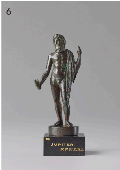
Statuette of Jupiter, about 1st–3rd century CE Probably Italy or France Bronze The British Museum, 1824,0453.1