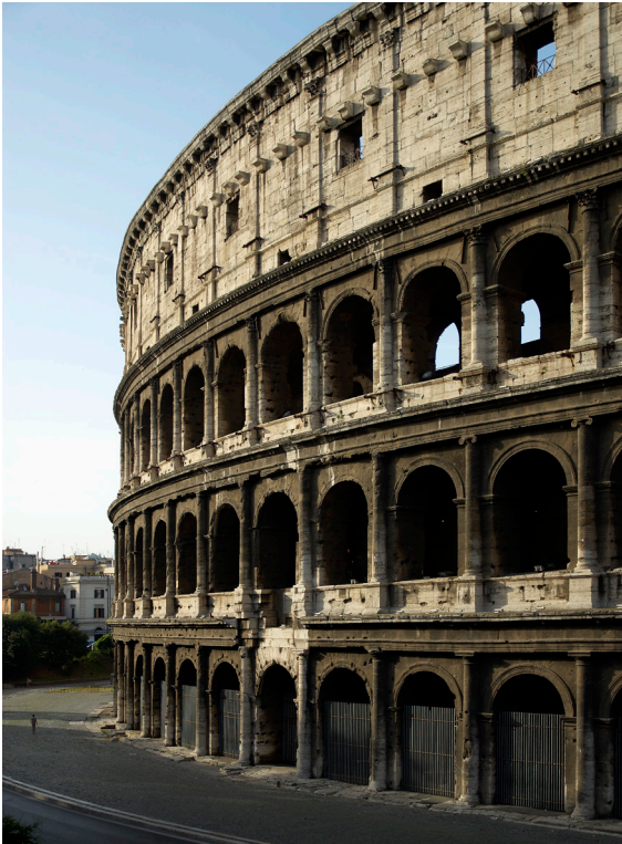
The Colosseum.

Emperors were determined to leave their mark on Rome with a series of massive building projects. The use of arches and vaults, made possible by the Roman invention of concrete, played a crucial role in the largest structures. A vast number of laborers and artisans transported materials such as marble and timber and constructed and decorated buildings. From the Colosseum to the Pantheon , we can witness the sheer scale and innovation of imperial architecture. Many of the monuments still bear their patrons' names—for example, the Baths of Caracalla , the Aqua Claudia , and the Arch of Constantine —immortalizing these rulers forever.