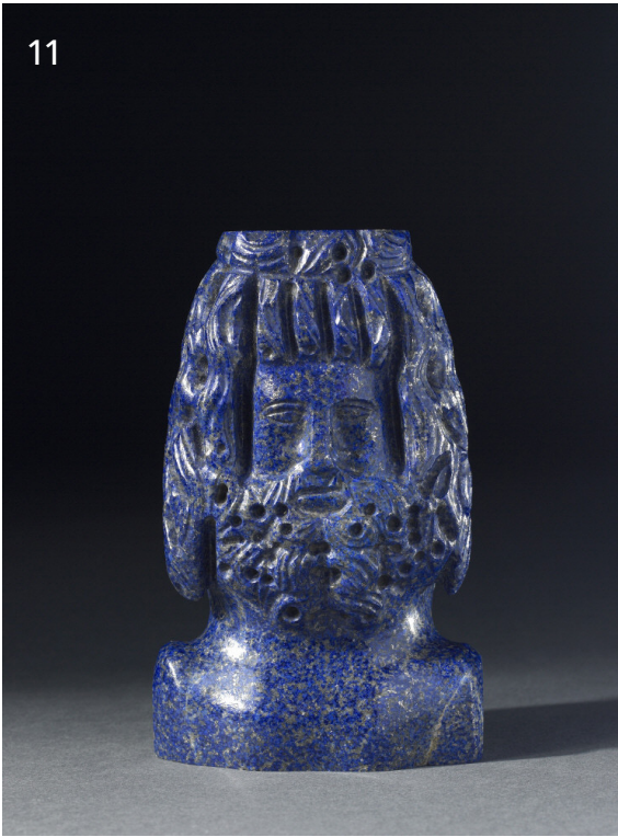
Bust of Serapis, about 300 CE Probably Egypt Lapis lazuli The British Museum, 1912,1016.1

11 In the Roman period, lapis lazuli was mined in Afghanistan and exported west to the Mediterranean world. It was highly prized for making jewelry and for creating blue pigments for painting. Here a large piece of lapis was carved into a head of the Egyptian god Serapis, a deity who was worshipped throughout the late Roman world, along with his consort Isis.