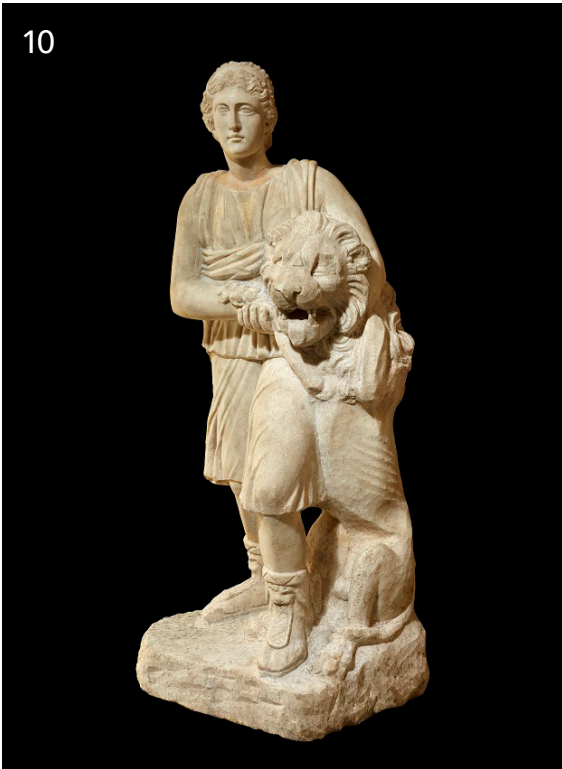
Statue of the nymph Cyrene fighting a lion, about 120–50 CE Cyrene (near modern Shahhat), Libya Marble The British Museum, 1861,0725.3

Roman North Africa consisted of several provinces: Mauretania in the west, and Africa Proconsularis and Numidia (mostly modern Morocco, Tunisia, and Algeria), Cyrenaica (mostly modern Libya), and Egypt in the center and to the east. Each became part of the empire at different times, and each was treated slightly differently. Overall, however, the African provinces prospered from the time of Augustus onward and became among the empire's wealthiest regions in the second century CE.