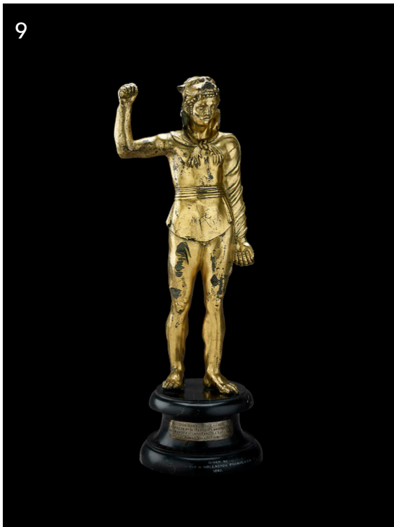
Gilded statuette of Hercules, 2nd century CE Said to be from near Birdoswald on Hadrian’s Wall, England Copper alloy The British Museum, 1895,0408.1

The presence of large multicultural Roman armies had significant cultural and religious influences. The fusing of local traditions with those of the conquerors can most easily be observed in smaller artifacts, especially jewelry and everyday objects. Many of these are found together in hoards, which were buried for safekeeping or for religious reasons.