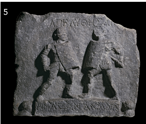
Relief showing two female gladiators, 1st–2nd century CE Halicarnassus (modern Bodrum), Turkey Marble The British Museum, 1847,0424.19