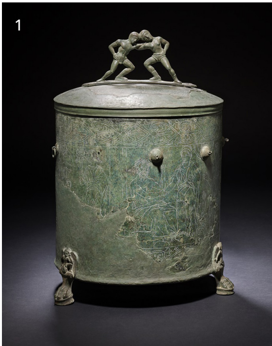
1 Casket, 300–250 BCE Probably Cerveteri, Italy Bronze The British Museum, 1847,1101.15