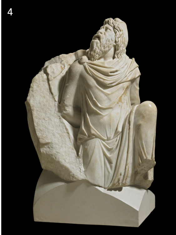
Statue fragment showing a captive “barbarian,” ca. 160–70 CE Ramleh, Egypt Marble The British Museum, 1973.0330.5

These victory monuments featured a variety of images. Depictions of defeated or dejected “barbarians” were used either as symbols of conquest or as representations of noteworthy resistance by noble adversaries. Victory was represented as a winged goddess, holding a wreath and palm branch.