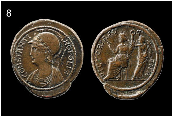
8 Medallion honoring the city of Constantinople, about 330–47 CE Minted in Rome, Italy Copper alloy The British Museum, R.13024

The last great monument constructed in Rome before the arrival of Christianity was the Arch of Constantine in 315 CE. Following Emperor Constantine's conversion to Christianity, all the major new buildings were churches. St. John Lateran became the seat for the bishops of Rome (later known as popes) in 324 CE, and although Rome's importance as a political center had been waning for over a century, it remained the spiritual heart of the empire. Despite the fall of the western Roman Empire in the fifth century CE, the eastern Roman Empire survived, to be called the Byzantine Empire , with its own capital of Constantinople (now Istanbul).