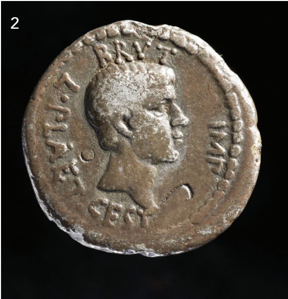
Roman Republican coin celebrating the assassination of Julius Caesar, 43–42 BCE Traveling mint with Junius Brutus Silver The British Museum, 1848,0819.147