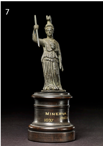
Statuette of Minerva, about 1st–3rd century CE Italy Bronze The British Museum, 1757,0315.11A

Jupiter (Zeus), king of the gods Juno (Hera), queen of the gods Apollo (Apollo), god of arts, healing, and the sun Bacchus (Dionysus), god of wine, drama, and rebirth Ceres (Demeter), goddess of agriculture Diana (Artemis), goddess of hunting and the moon Mars (Ares), god of war Mercury (Hermes), god of travelers, merchants, and thieves Minerva (Athena), goddess of wisdom, crafts, and war Neptune (Poseidon), god of the sea and earthquakes Venus (Aphrodite), goddess of love and procreation Vulcan (Hephaistos), god of crafts