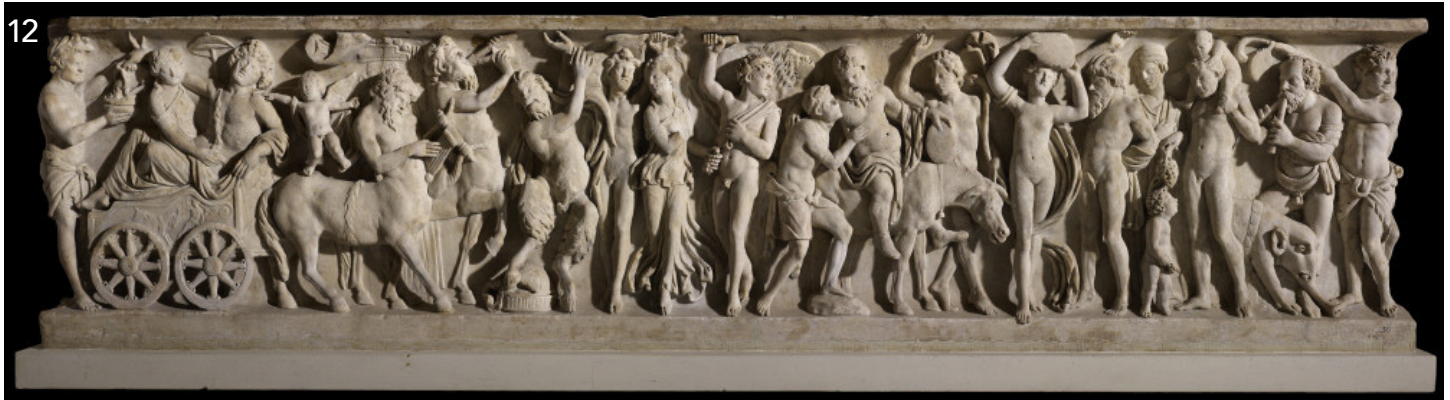
Sarcophagus showing the wedding of Bacchus and Ariadne, 2nd century CE Rome, Italy Marble The British Museum, 1805,0703.130

Memorials provide a visible and long-lasting reminder of how people wanted themselves, or their families, to be remembered and give us fascinating and lasting insights into the individuals who made up the city and empire of Rome.