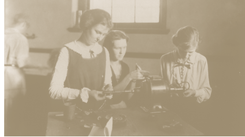
Archival photograph, n.d. Art Students in the metalwork studio of the Newcomb Art School, Broadway Street campus.