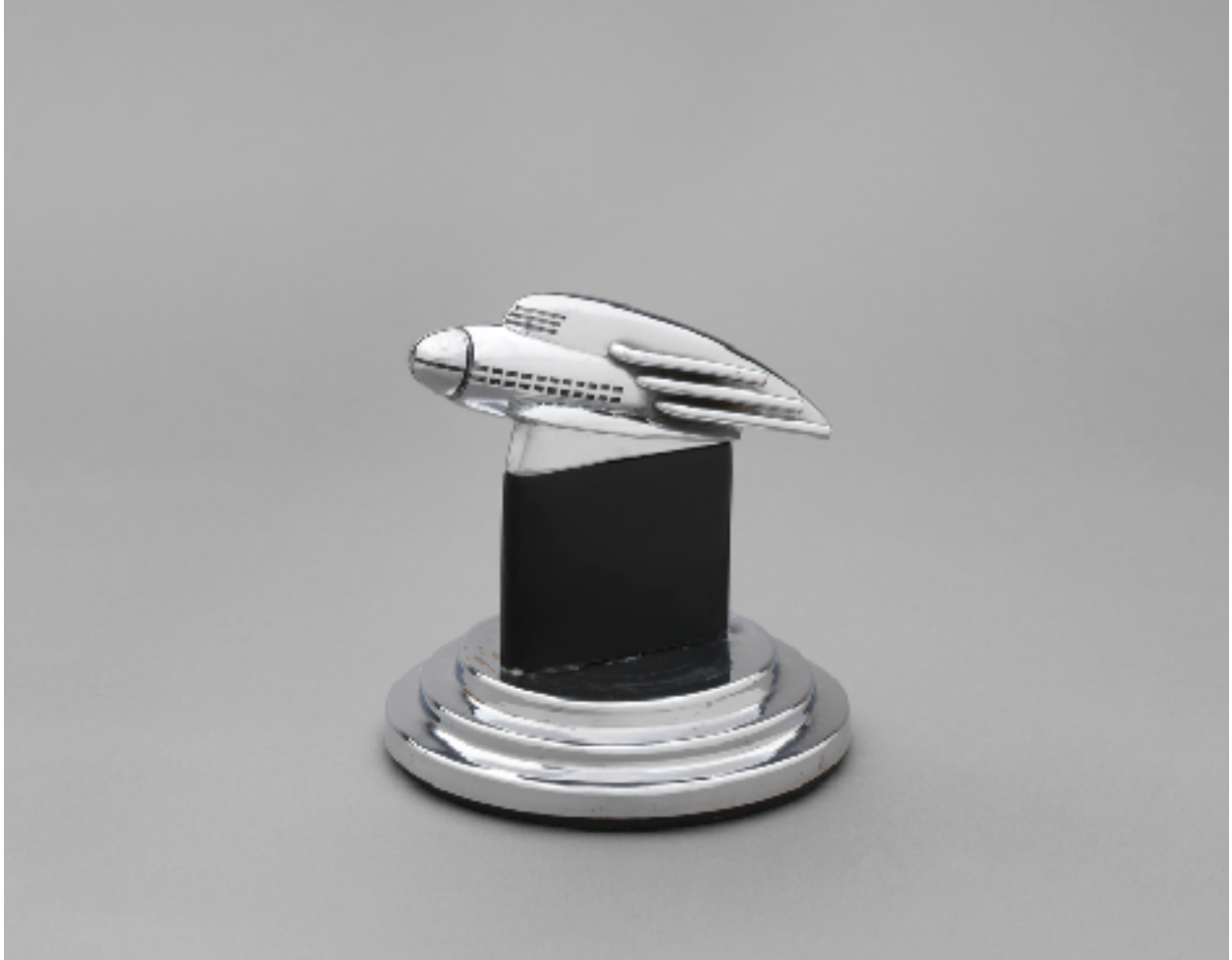
Raymond Loewy, designer (American, born France, 1893–1986); Hupp Motor Company, manufacturer (Detroit, Michigan, 1908–1941). Hupmobile Hood Ornament, 1936–38. Chromium-plated metal, 6 3/8 x 6 1/8 x 6 1/4 in. Marshall V. Miller Collection