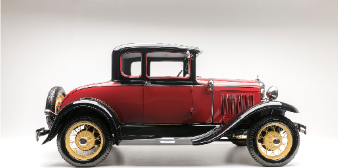
Ford Motor Company, manufacturer (Detroit, Michigan, founded 1903). Model A Automobile, 1930. The Dishner Family Collection.