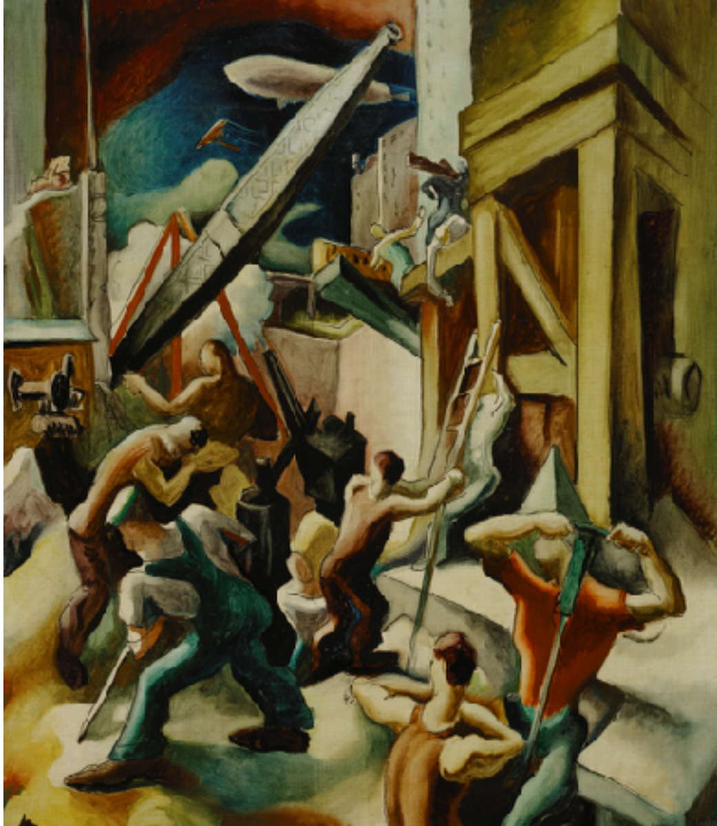
Thomas Hart Benton (American, 1889–1975). Construction, 1923. Ink with oil wash on canvas, 27 3/4 x 23 3/4 in. The Nelson-Atkins Museum of Art, Kansas City, Missouri, Bequest of the artist, F75-21/42.