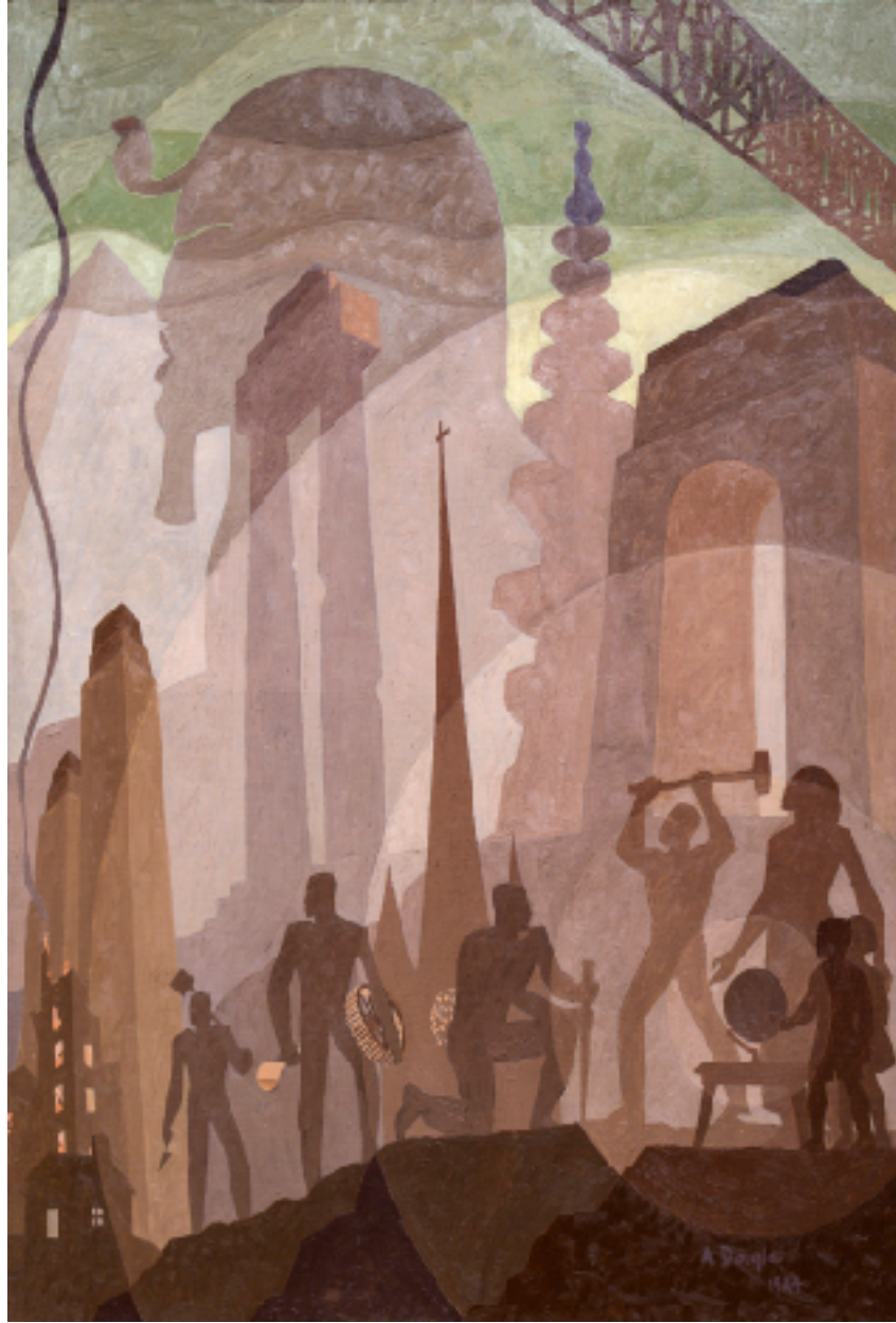
Aaron Douglas (American, 1899–1979). Building More Stately Mansions, 1935. Oil on canvas, 54 x 42 in. Fisk University Galleries, Nashville, Tennessee.