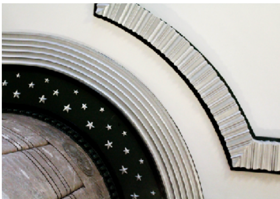
Ceiling detail, Grand Lobby, Frist Art Museum.