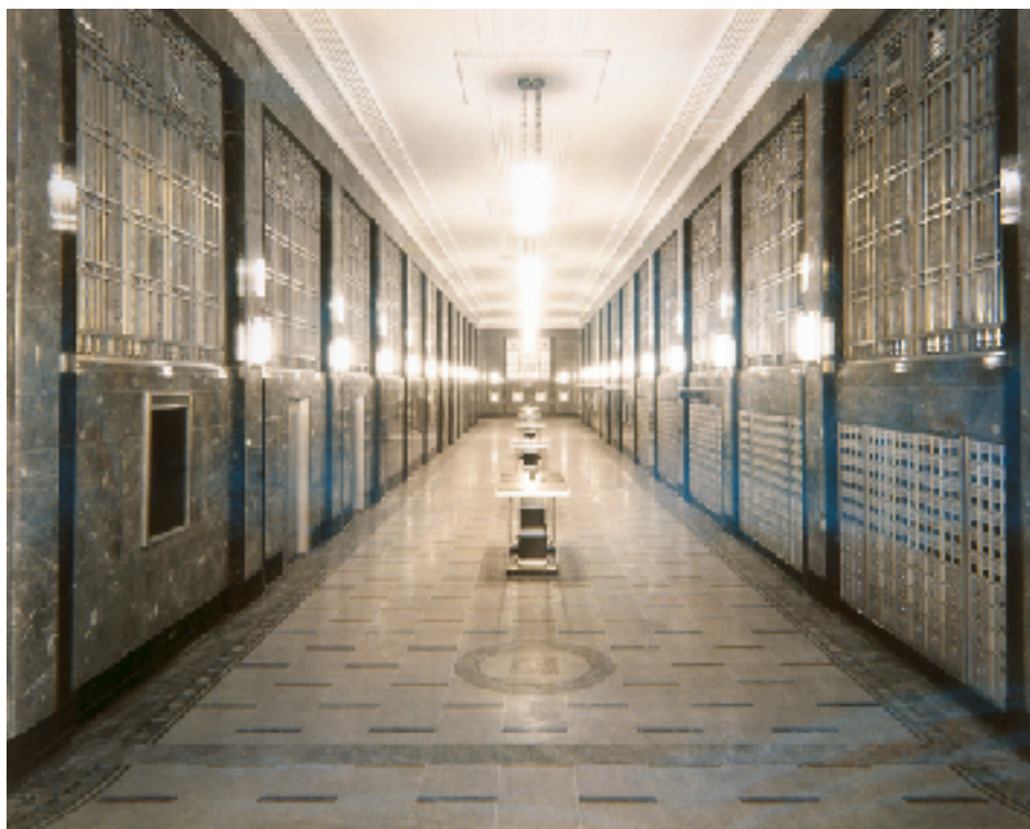
Lobby of the Nashville Post Office.