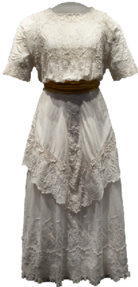
Maker unknown. Dress, 1920s. Cotton with reproduction sash, 50 x 36 x 1 1/2 in. Tennessee State Museum, 79.105.2